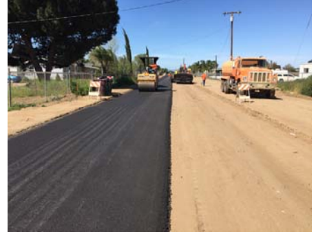
Hunter Road, all paved!