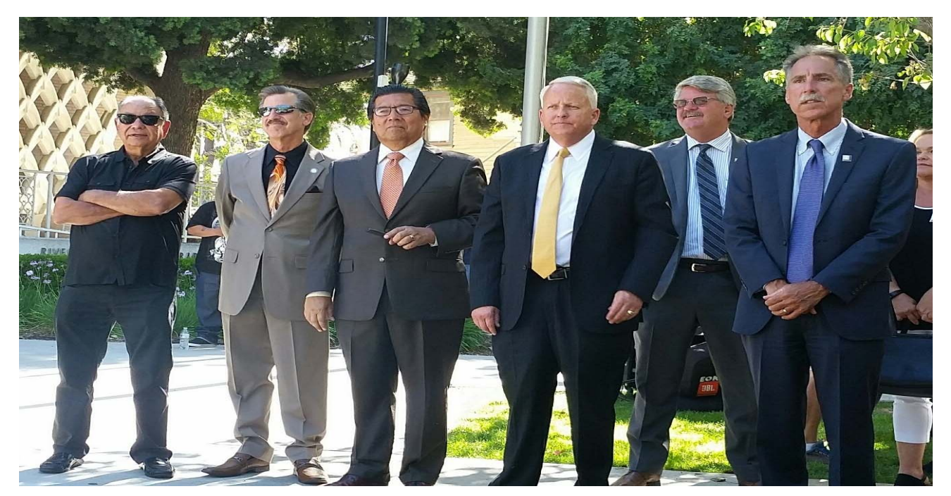
City of Riverside Council members and Cheech Marin at the May 2nd announcement of the new Cheech Marin Center for Chicano Art.

The proposed location for the Cheech Marin Center for Chicano Art, Culture, and Industry, is the building that currently houses Riverside's Main Library, which is moving to a new location downtown. The Riverside City Council will vote on the transformation of the center at its May 16th, 2017, council meeting.