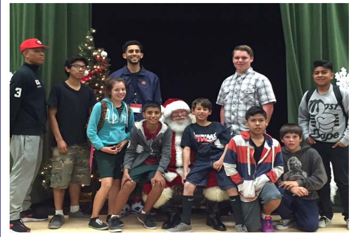
(Above) Some of the local youth who stopped by to see Santa Claus and take part in the Annual Cookies with Santa at the Lakeland Village Elementary School.