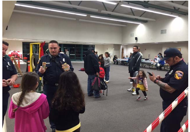
(Above) Kids ran from game to game and even the local firefighters took part in assisting the kids with their games at the Cookies with Santa event in Lakeland Village.