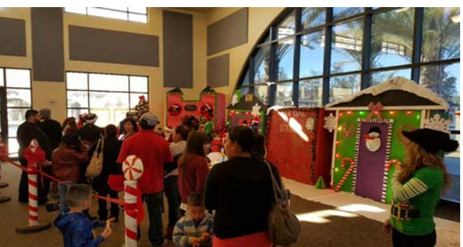
(Above) The line to see Santa Claus was a long one after breakfast and games. A great event staffed by over 40+ community volunteers and District #1 staff.