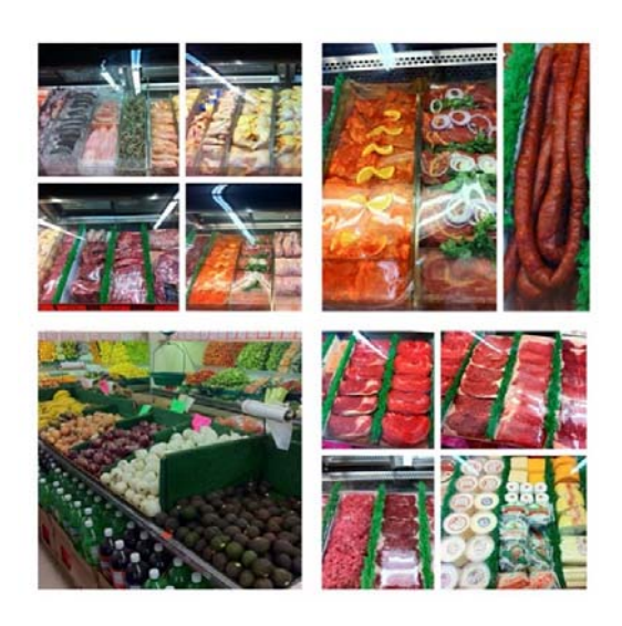
Fresh fruits, meats and more all at Midway!