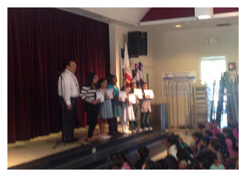
Manuel Real Elementary in Mead Valley