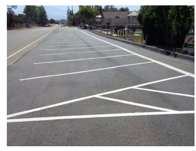
Additional Parking Added To Park And Community Center

Transportation & Land Management Agency (TLMA) recently added another first district project to the completion list with paving improvements and the addition of new parking stalls at the Good Hope Community Center and Park. This is the first phase in the much anticipated renovation of the existing park. Plans for the new park design are set to be released soon which have included direct input from several local residents.