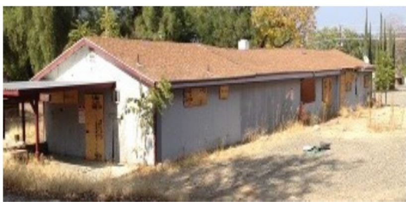
Frightening Fact: The county spent $420,000 to buy this building in 2011

Many local residents expressed their gratitude to our office for having solved the mystery and "exorcised" the hauntings which existed in their neighborhood.