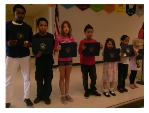
Pictured: Woodcrest Elementary Students