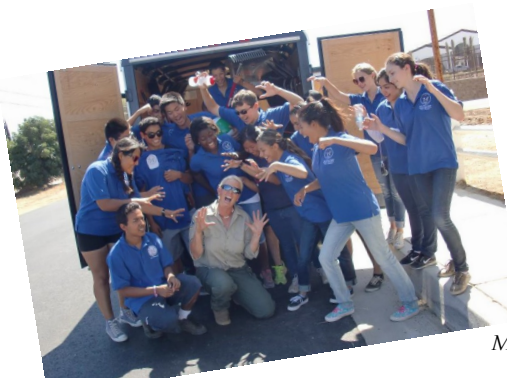
1st District YAC members cleaned up the trail on Rider Street for the opening of the Mead Valley Community Center, 8-17-13.

Supervisor Kevin Jeffries–District #1 Website- www.SupervisorJeffries.org Email - district1@rcbos.org 4080 Lemon St, 5th Floor Riverside, CA 92501 (951) 955-1010 * 31569 Canyon Estates Drive, Suite 113, Lake Elsinore, CA 92532 (951) 471-4500